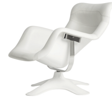
Shell: glass fibre and chromed steel Base: fibreglass Upholstery: leather white Rotating, felt glides