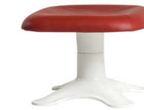
Base: fibreglass Upholstery: leather red