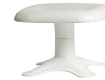
Base: fibreglass Upholstery: leather white