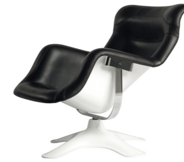
Shell: glass fibre and chromed steel Base: fibreglass Upholstery: leather black Rotating, felt glides