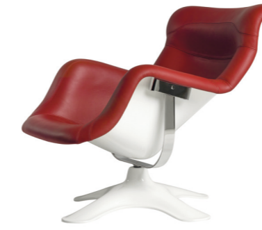
Shell: glass fibre and chromed steel Base: fibreglass Upholstery: leather red Rotating, felt glides