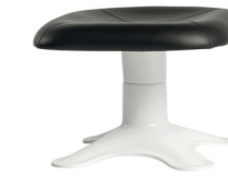
Base: fibreglass Upholstery: leather black